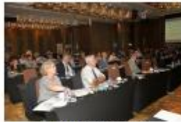
Day One Conference

As one of the major events in the year of 20th anniversary of Hong Kong Institute of Value Management (HKIVM), the Joint HKIVM-SAVE International Conference was successfully held from 8 to 9 May 2015 at Royal Plaza Hotel in Hong Kong. It was also the 12th International Conference of HKIVM and the 4th Asian VE Conference of SAVE International.